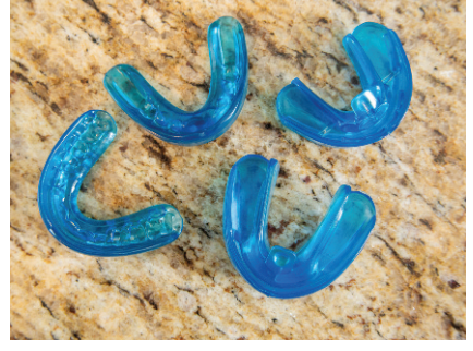
The practice offers multiple nonsurgical options to treat airway issues, including custom palatal expanders, myofunctional therapy, and oral appliance therapy.